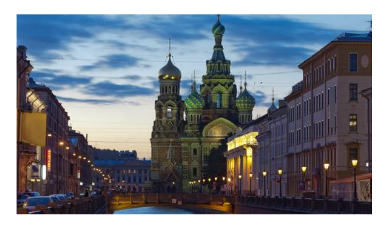
Location: Center of Modern Art Saint Petersburg, Stolyarny Pereulok 18